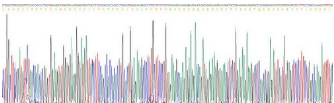
Figure . Gene Sequencing (extract)