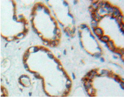
Used in DAB staining on formalin fixed paraffin-embedded kidney tissue