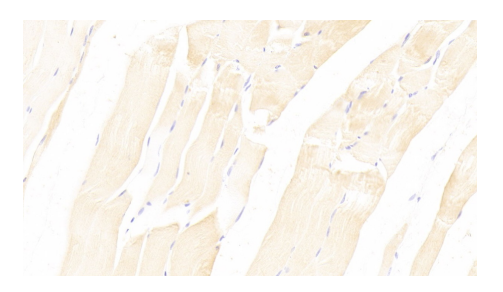
DAB staining on IHC-P; Sample: Rat Skeletal muscle Tissue; Primary Ab: 20µg/ml Mouse Anti-Rat NRP2 Antibody Second Ab: 2µg/mL HRP-Linked Caprine Anti-Mouse IgG Polyclonal Antibody (Catalog: SAA544Mu19)