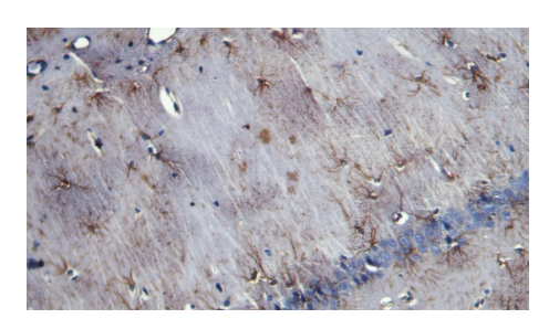
DAB staining on IHC-P; Samples: Rat Cerebrum Tissue; Primary Ab: 20µg/ml Mouse Anti-Rat GFAP Antibody Second Ab: 2µg/mL HRP-Linked Caprine Anti-Mouse IgG Polyclonal Antibody (Catalog: SAA544Mu19)