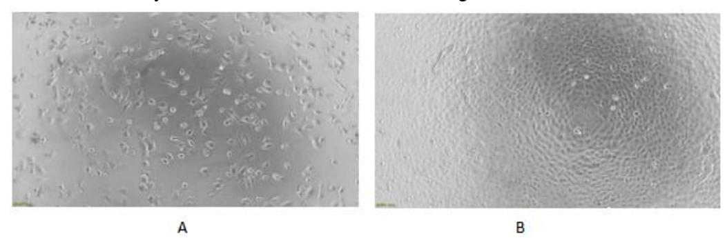
Figure 1. Inhibition of A549 cells proliferation after stimulated with FBLN2

After incubated for 72h, cells were observed by inverted microscope and cell proliferation was measured by Cell Counting Kit-8 (CCK-8). Briefly, 10 \mu l of CCK-8 solution was added to each well of the plate, then the absorbance at 450 nm was measured using a microplate reader after incubating the plate for 1h at 37 ^{\circ} C. Proliferation of A549 cells after incubation with FBLN2 for 72h observed by inverted microscope was shown in Figure 1. Cell viability was assessed by CCK-8 (Cell Counting Kit-8 ) assay after incubation with recombinant mouse FBLN2 for 72h. The result was shown in Figure 2. It was obvious that FBLN2 significantly inhibit cell viability of A549 cells. The ED50 is 1.25 \mu g/mL.